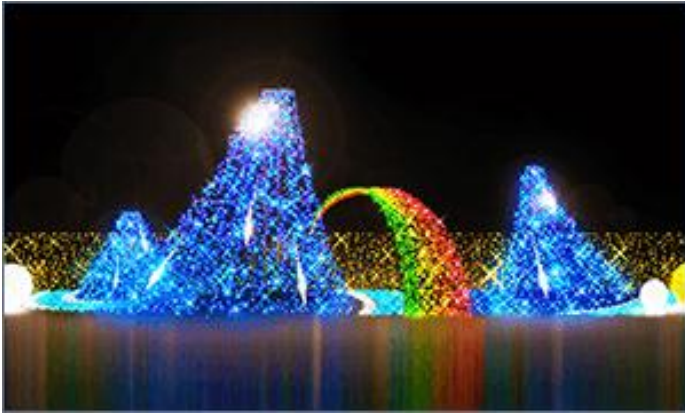
Festival of the light