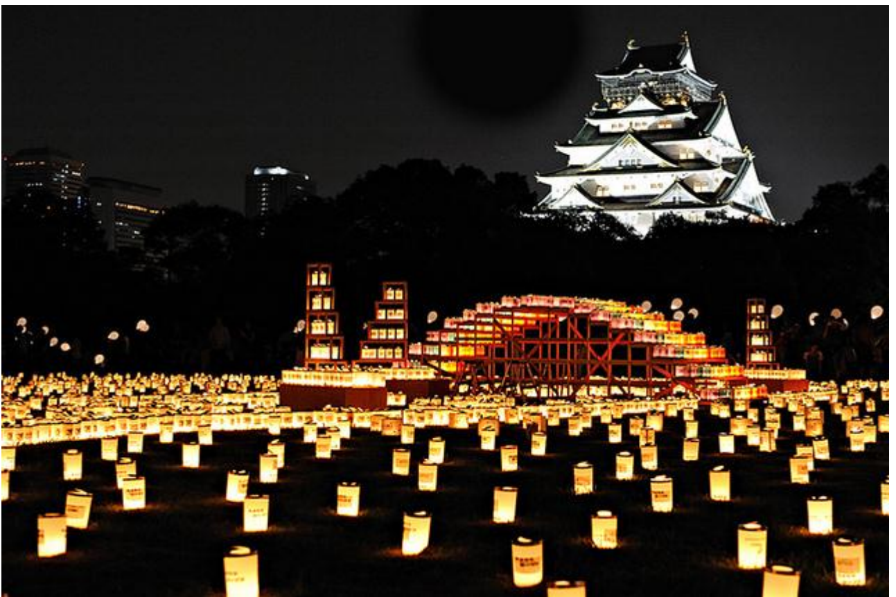
Festival of the light