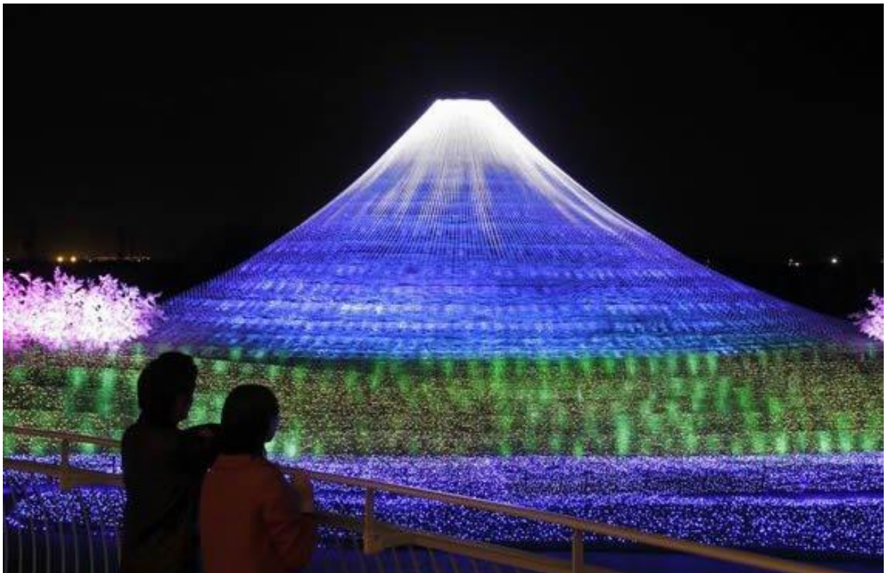
Toki no sumika