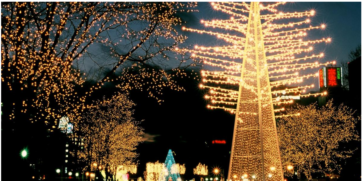
Sapporo White Illumination