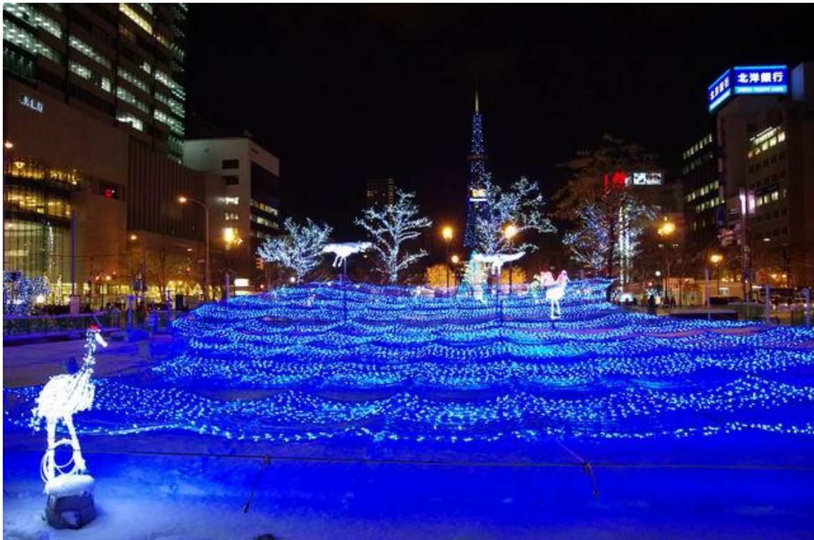
Sapporo White Illumination