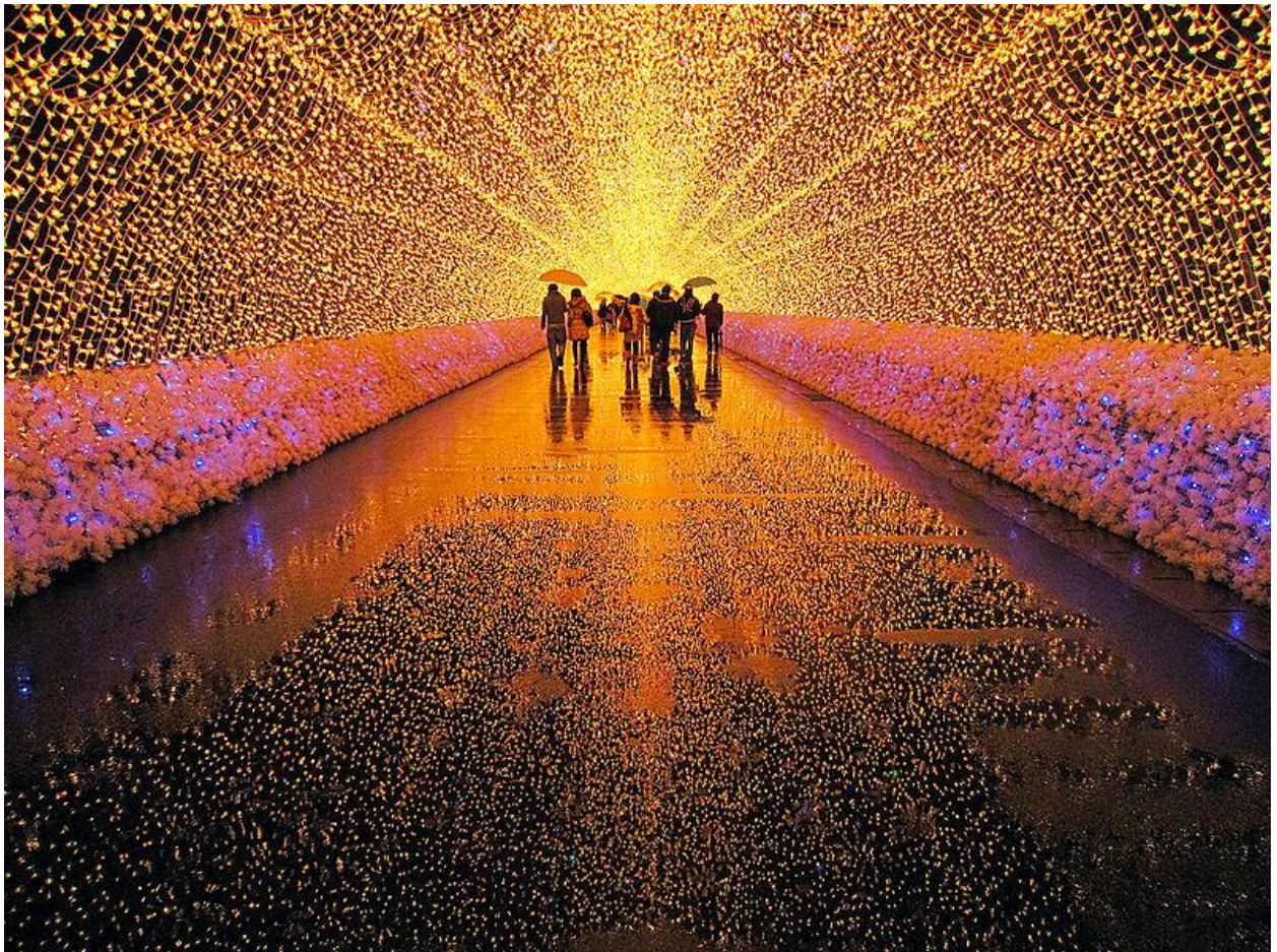
Toki no sumika