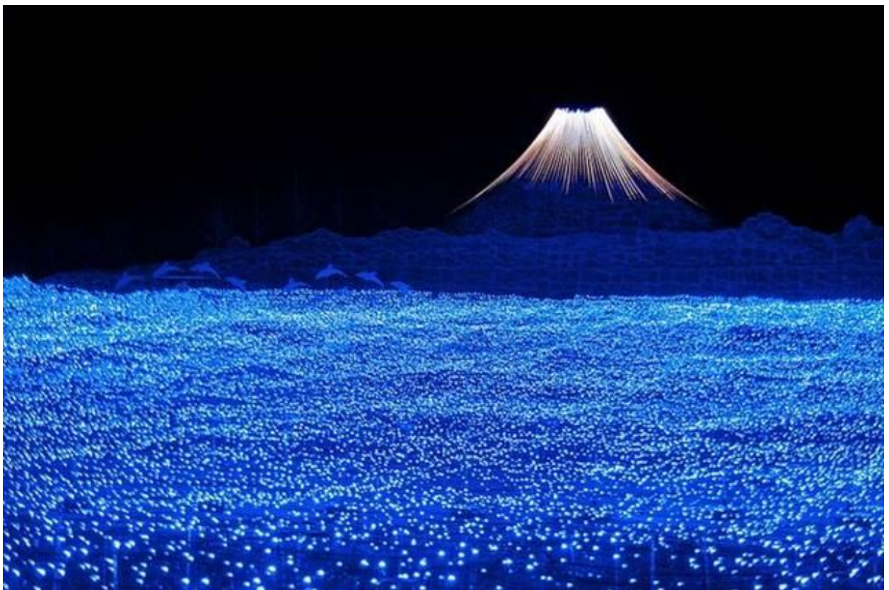
Nabana no Sato