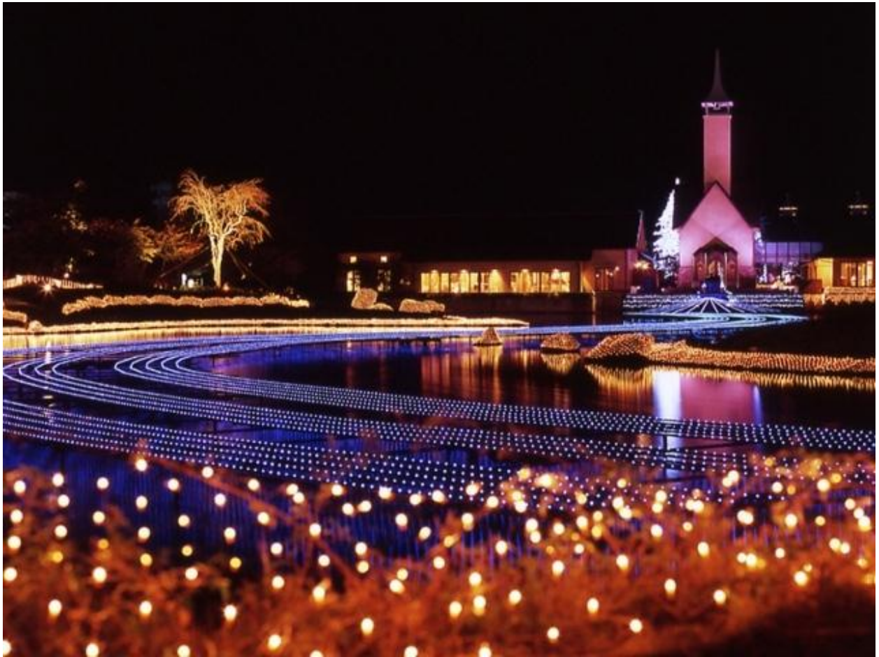
Nabana no Sato